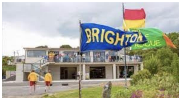
Photos of Brighton over the season